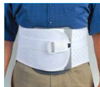
Anterior panel provides additional ergo-dynamic abdominal comfort and support.